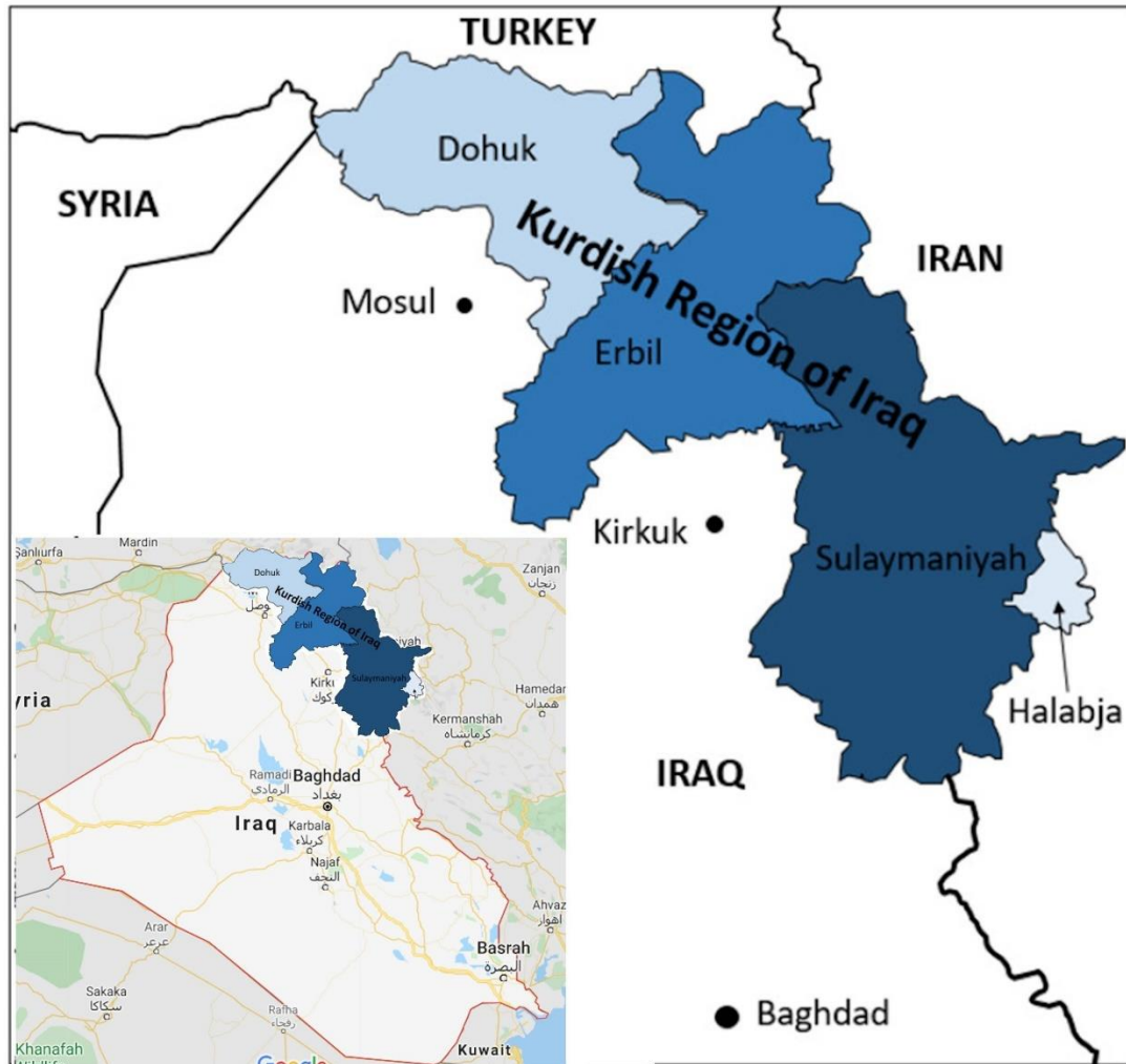
Figure 1: Map of the Iraqi Kurdistan Region [12]

wide border with Iraq, KR (semi-autonomous region in Iraq Figure 1) has issued several decisions in several subsequent steps to protect the spread of the outbreak in the region [11].