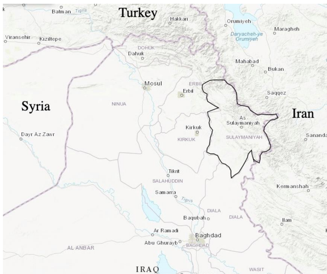
Figure 1: Map of the study area (Sulaymaniyah Province). The map was designed by Landsatlook viewer (USGS Products, Data available from the U.S. Geological Survey). The black line indicates the geographical area of Sulaymaniyah province

EDTA preserved venous blood were randomly collected from 85 staffs and students in the University of Garmian. The collected population samples represent populations of Sulaymaniyah province, Kurdistan Regional Government (KRG) of Iraq. The sample distributions among Sulaymaniyah province are shown in the Supplementary Table 1 . Only Kurdish people, whose family originally descended from Kurdish ancestry, were included in this study. Others with different backgrounds, such as Arabic, were excluded. An informed consent form was filled by each participant and the research was approved by an ethical committee of Department of Biology, College of Education, University of Garmian (Ethical committee No.2: 07/01/2020). The study was conducted in accordance with the Declaration of Helsinki. The collected blood samples were kept in a refrigerator until total genomic DNA were extracted. This study was conducted in April 2019 and its geographical area is shown in Fig. 1.